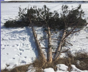
One of eight bundles of five trees which were cabled together and anchored to shoreline.

You Don't Go Fishing To Escape Life... You Go Fishing to Live Your Life!